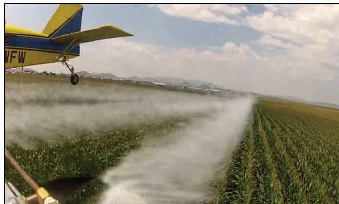
Photo taken using a GoPro camera attached to the end of the spray boom of the AT-402B applying fungicides to corn. This photo clearly illustrates that no sign of any product entering the wingtip vortices, confirming that the atomizers were installed in the correct position.