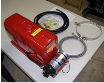
1.5 gallon smoker